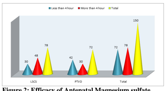
Figure 2: Efficacy of Antenatal Magnesium sulfate